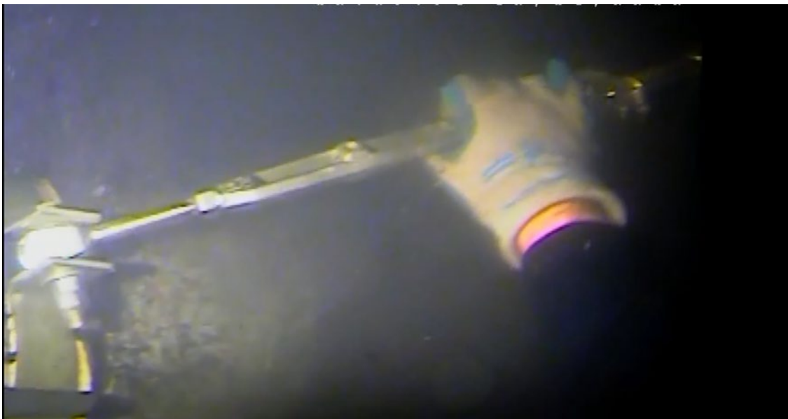
Image 7 – Lower epoxy and woven fiber wrap treatment with two-part clamp (typical)