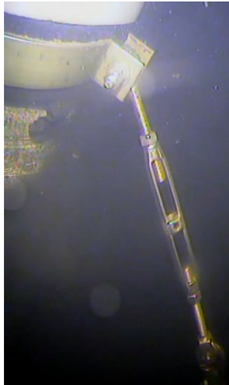
Image 6 – Upper clamp-to-turnbuckle connection of soft reaction bracing (typical)

"Engineered Solutions for Water in the West"