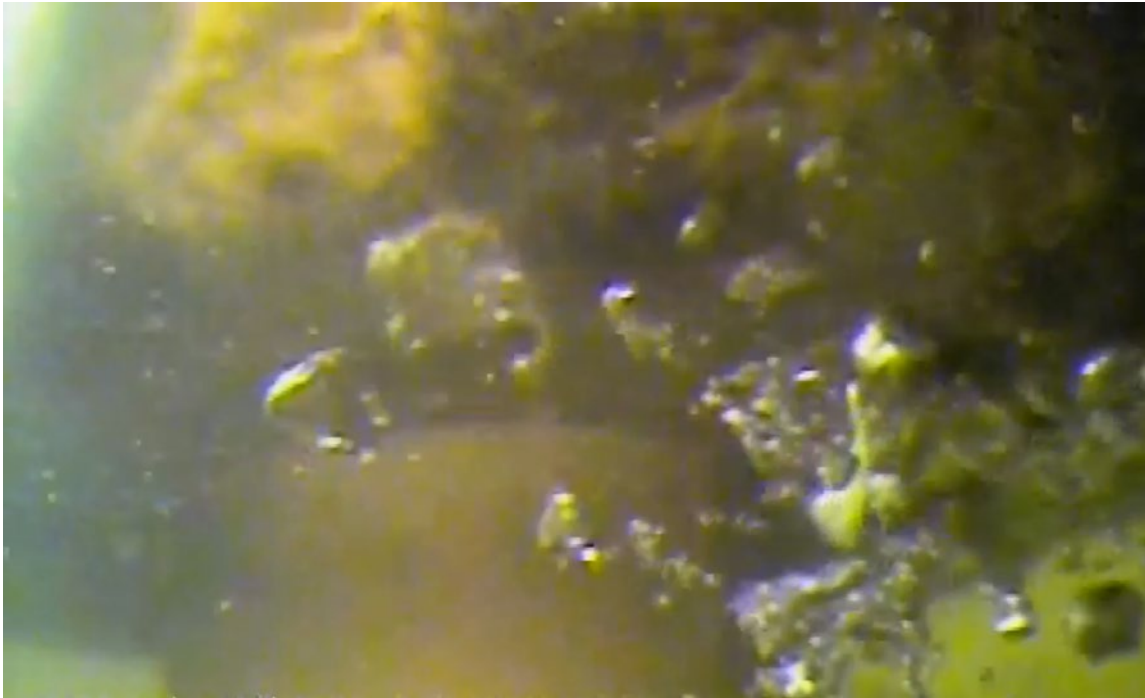
Image 8 – Interface of plastic UV protective wrap under concrete encapsulation (typical)

"Engineered Solutions for Water in the West"