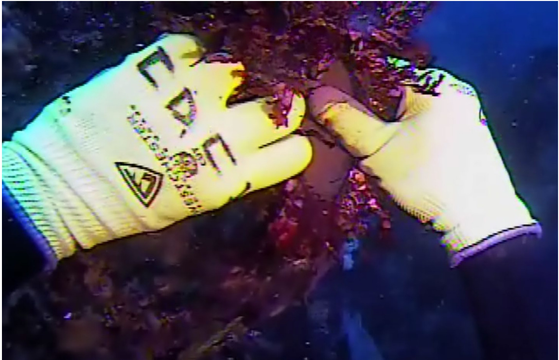
Image 2 – Duckbill contact sealing surface during no-flow (2021 image)

functioning as intended. The interior sealing surface of the rubber valves, or "lips" are clean and free from any marine fouling or observable deposits that would prevent full closure and full sealing contact when under a no-flow condition. With full closure contact, the migration of sediment from the ocean is prevented. Reference survey video file "2021_OutfallSurvey_DiffuserSection" from 10:07:40 to 10:07:50